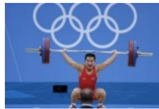
North Korean lifts 3 times body weight