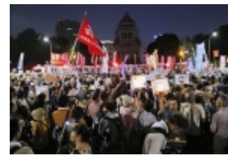
Anti-nuke protesters surround Japanese parliament