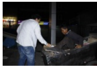
'Sahur' on the road, a Jakarta tradition